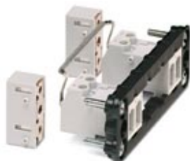
Panel mounting frame, with capacitive PE, for contact insert modules, type 4, number of insert modules 5

Please be informed that the data shown in this PDF Document is generated from our Online Catalog. Please find the complete data in the user's documentation. Our General Terms of Use for Downloads are valid ( http://phoenixcontact.com/download )