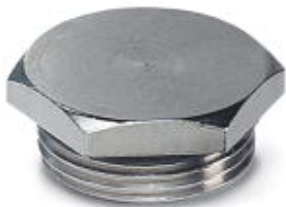
Filler plug, metal, size: M20

Please be informed that the data shown in this PDF Document is generated from our Online Catalog. Please find the complete data in the user's documentation. Our General Terms of Use for Downloads are valid ( http://phoenixcontact.com/download )