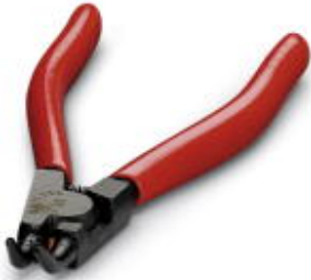
Contact removal tool for HC-M-EMV contact carriers

Please be informed that the data shown in this PDF Document is generated from our Online Catalog. Please find the complete data in the user's documentation. Our General Terms of Use for Downloads are valid ( http://phoenixcontact.com/download )