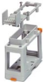
Plug assembly board, 150 mm, with base element, snaps onto NS 35/7.5 and NS 35/15, for contact inserts HC-D 25

Please be informed that the data shown in this PDF Document is generated from our Online Catalog. Please find the complete data in the user's documentation. Our General Terms of Use for Downloads are valid ( http://phoenixcontact.com/download )