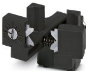
Replacement stripping knives 1.5 mm 2 , for crimp automat CF 3000

Please be informed that the data shown in this PDF Document is generated from our Online Catalog. Please find the complete data in the user's documentation. Our General Terms of Use for Downloads are valid ( http://phoenixcontact.com/download )