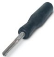
Contact removal tool, for rotated CK-4,0-... contacts

Please be informed that the data shown in this PDF Document is generated from our Online Catalog. Please find the complete data in the user's documentation. Our General Terms of Use for Downloads are valid ( http://phoenixcontact.com/download )