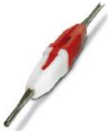
Insertion/extraction tool, to insert and extract the D-SUB standard signal contacts

Please be informed that the data shown in this PDF Document is generated from our Online Catalog. Please find the complete data in the user's documentation. Our General Terms of Use for Downloads are valid ( http://phoenixcontact.com/download )