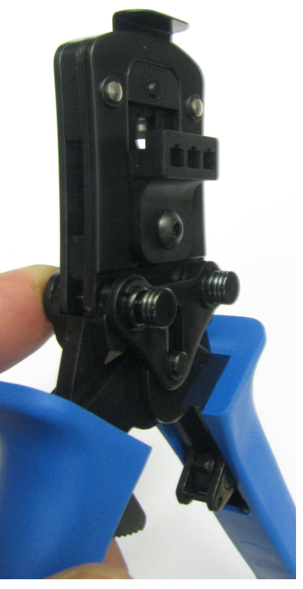
Pictrue 1: Pressing out the locking pins from the front

Note: The emergency ratchet-release mechanism of the hand tool has detents that are audible as "clicks" as the handles will be closed. The emergency ratchet-release mechanism releases on the last click.