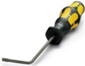
QUICKON lever tool, with angled head for confined spaces

Please be informed that the data shown in this PDF Document is generated from our Online Catalog. Please find the complete data in the user's documentation. Our General Terms of Use for Downloads are valid ( http://phoenixcontact.com/download )