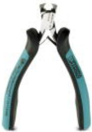
Electronic front cutter, 20° angle, without chamfer, with opening spring

Please be informed that the data shown in this PDF Document is generated from our Online Catalog. Please find the complete data in the user's documentation. Our General Terms of Use for Downloads are valid ( http://phoenixcontact.com/download )