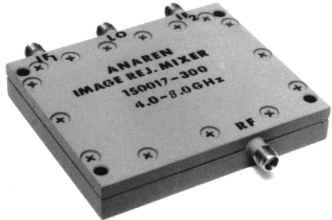
Model 150017-300 shown above

NOTES: Electrical and Mechanical Specifications subject to change without notice