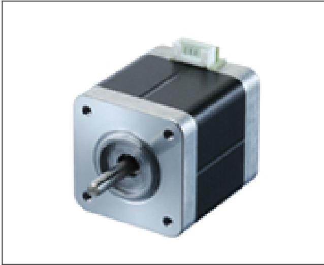
17pmk product picture