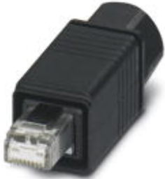
RJ45 connector, IP65/IP67, with push/pull interlocking (version 4), plastic housing, for 10 Gbps, for 24 ... 28 AWG stranded conductors

Please be informed that the data shown in this PDF Document is generated from our Online Catalog. Please find the complete data in the user's documentation. Our General Terms of Use for Downloads are valid ( http://phoenixcontact.com/download )