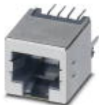
RJ45 socket insert, 1-way, for PCB mounting, CAT5e, 8-pos., shielded, with straight solder pins (THT)

RJ45 socket insert - CUC-V04-BU-180 - 1407409