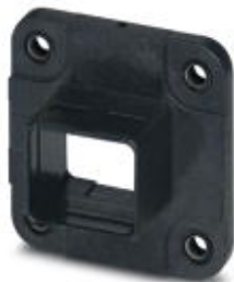
Panel mounting frames, Degree of protection: IP65/67, Material: Plastic

Please be informed that the data shown in this PDF Document is generated from our Online Catalog. Please find the complete data in the user's documentation. Our General Terms of Use for Downloads are valid ( http://phoenixcontact.com/download )