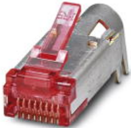
RJ45 male insert, CAT6, 8-pos., shielded, IDC pierce connection, for AWG 27 litz wires ... 24, with strain relief

Please be informed that the data shown in this PDF Document is generated from our Online Catalog. Please find the complete data in the user's documentation. Our General Terms of Use for Downloads are valid ( http://phoenixcontact.com/download )