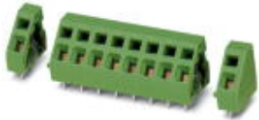
The illustration shows the 10-position version

PCB terminal block, Nominal current: 24 A, Nom. voltage: 400 V, Pitch: 5.08 mm, Number of positions: 20, Connection method: Spring-cage connection, Mounting: Soldering, Conductor/PCB connection direction: 45 °, Color: green