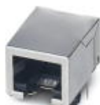
RJ45 socket insert, 1-way, for PCB assembly, CAT5e, 8-pos., shielded, with angled solder pins (SMD)

RJ45 socket insert - CUC-V04-BU-90 - 1407408