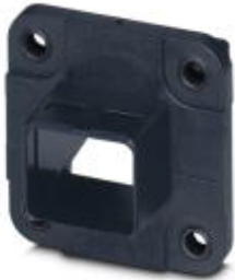
Panel mounting frames, Degree of protection: IP65/67, Material: Plastic

Please be informed that the data shown in this PDF Document is generated from our Online Catalog. Please find the complete data in the user's documentation. Our General Terms of Use for Downloads are valid ( http://phoenixcontact.com/download )