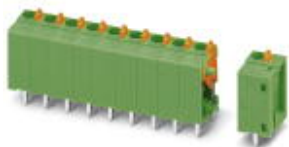
The illustration shows the 10-position version

PCB terminal block, Nominal current: 15 A, Nom. voltage: 320 V, Pitch: 5.08 mm, Number of positions: 16, Connection method: Spring-cage connection, Mounting: Soldering, Conductor/PCB connection direction: 90 °, Color: green