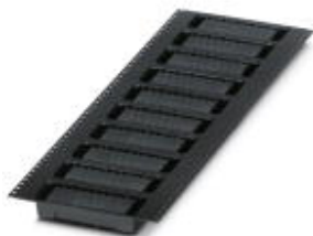
The illustration shows the 10-position version

Please be informed that the data shown in this PDF Document is generated from our Online Catalog. Please find the complete data in the user's documentation. Our General Terms of Use for Downloads are valid ( http://phoenixcontact.com/download )