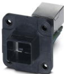
Panel mounting frame set, Degree of protection: IP65/67, Number of positions: 8, Material: Plastic

Please be informed that the data shown in this PDF Document is generated from our Online Catalog. Please find the complete data in the user's documentation. Our General Terms of Use for Downloads are valid ( http://phoenixcontact.com/download )