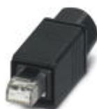
RJ45 connector, IP65/IP67, with push/pull interlocking (version 4), plastic housing, for 10 Gbps, for 24 ... 28 AWG stranded conductors

RJ45 connector - CUC-V04-RJ45-POBK-8 - 1407413