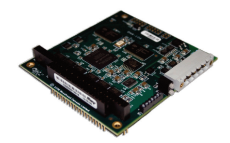
DN4 DeviceNet PC/104 Card Series 112005

112005 PC/104 Card 112113 PCU (PCI) Card