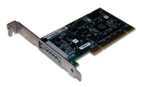
DN4 DeviceNet PCU Card Series 1112113