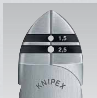
Multi-functional: cutting and stripping