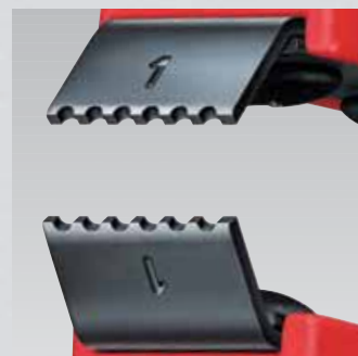
Precisely milled blades for clean stripping