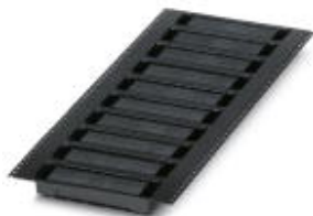
The illustration shows the 10-position version

Please be informed that the data shown in this PDF Document is generated from our Online Catalog. Please find the complete data in the user's documentation. Our General Terms of Use for Downloads are valid ( http://phoenixcontact.com/download )