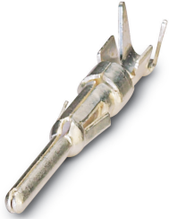
Crimp contact, rolled, Single contact, contact diameter: 1 mm, crimp range: 0.22 mm 2 ... 0.56 mm 2 , Single contact

Please be informed that the data shown in this PDF Document is generated from our Online Catalog. Please find the complete data in the user's documentation. Our General Terms of Use for Downloads are valid ( http://phoenixcontact.com/download )