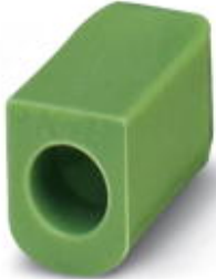
Keying cap, for forming sections, plugs onto header pin, green insulating material

Please be informed that the data shown in this PDF Document is generated from our Online Catalog. Please find the complete data in the user's documentation. Our General Terms of Use for Downloads are valid ( http://phoenixcontact.com/download )