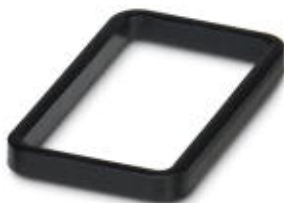
Profile gasket for type B10 supporting base element

Please be informed that the data shown in this PDF Document is generated from our Online Catalog. Please find the complete data in the user's documentation. Our General Terms of Use for Downloads are valid ( http://phoenixcontact.com/download )