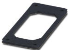
Flange seal, for HEAVYCON type B10 panel mounting base, self-adhesive, foam rubber made from cellular rubber, color: black

Please be informed that the data shown in this PDF Document is generated from our Online Catalog. Please find the complete data in the user's documentation. Our General Terms of Use for Downloads are valid ( http://phoenixcontact.com/download )