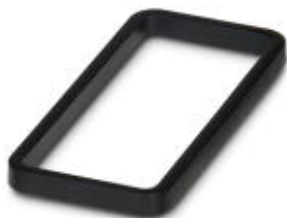
Profile gasket for type B16 supporting base element

Please be informed that the data shown in this PDF Document is generated from our Online Catalog. Please find the complete data in the user's documentation. Our General Terms of Use for Downloads are valid ( http://phoenixcontact.com/download )