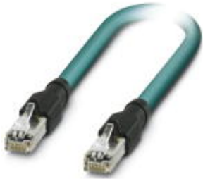
Patch cable, CAT5e, 4-pair, shielded, line, assembled at both ends with straight RJ45/IP20 heads, length: 5 m

Please be informed that the data shown in this PDF Document is generated from our Online Catalog. Please find the complete data in the user's documentation. Our General Terms of Use for Downloads are valid ( http://phoenixcontact.com/download )