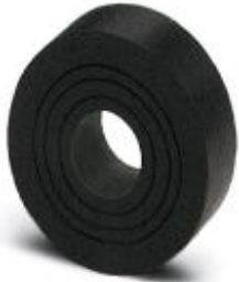
Notched seals/2 washers, for pressure screws, type Pg11

Please be informed that the data shown in this PDF Document is generated from our Online Catalog. Please find the complete data in the user's documentation. Our General Terms of Use for Downloads are valid ( http://phoenixcontact.com/download )