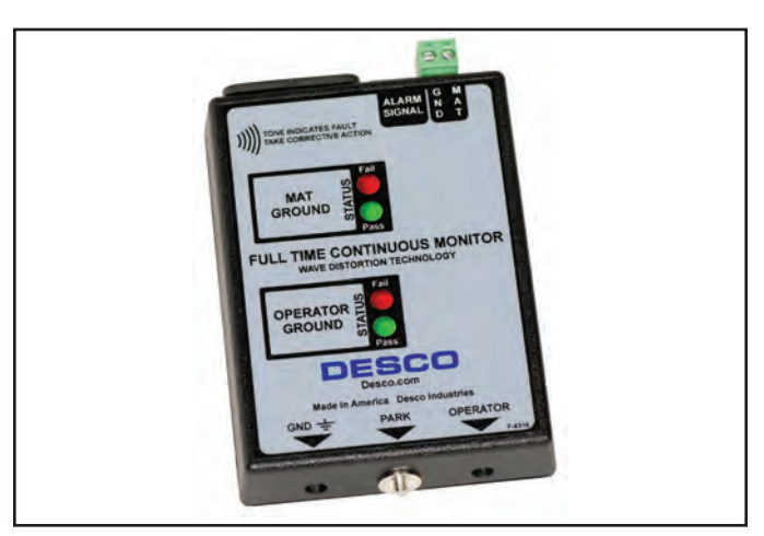
Figure 1. Desco Full-Time Continuous Monitor