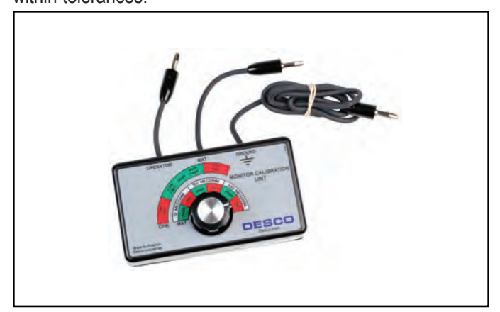
Figure 7. Desco <u>98220</u> Single-Wire Monitor Calibration

We recommend that calibration be performed annually, using the Desco 98220 Single-Wire Monitor Calibration Unit. This Calibration Unit is a most important product which allows the customer to perform NIST traceable calibration on Desco single-wire continuous monitors. It is designed to be used on the shop floor at the workstation, virtually eliminating downtime, verifying that the continuous monitor is operating within tolerances.