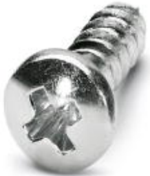
Screw set for DFK-PC 16... connectors

Please be informed that the data shown in this PDF Document is generated from our Online Catalog. Please find the complete data in the user's documentation. Our General Terms of Use for Downloads are valid ( http://phoenixcontact.com/download )