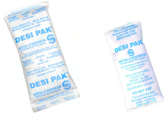
13843 & 13844

In order to provide a complete moisture barrier packaging assembly, desiccant must be inserted into the bag, prior to having the bag vacuum sealed. The recommended amount of desiccant is dependent on the interior surface area of the bag to be used. The table is a reference indicating recommended minimum amounts of desiccant that should be used with Moisture Barrier Bags .