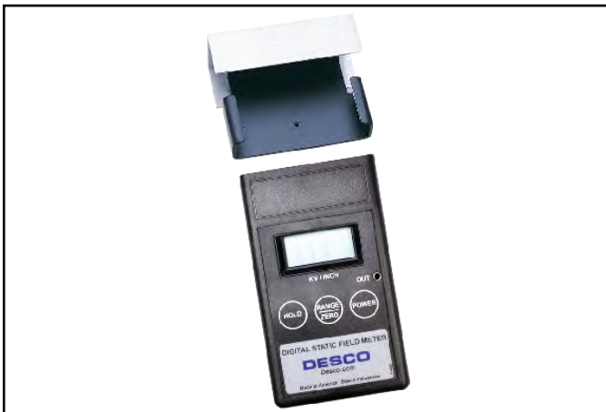
Figure 4. Installing the 19498 Conductive Plate

The Digital Static Field Meter's case has two slots along its sides. The top slot is closest to the face of the instrument. Slide down the tabs of the Conductive Plate into the top slot of the Meter's case as far as they go (see Figure 4).