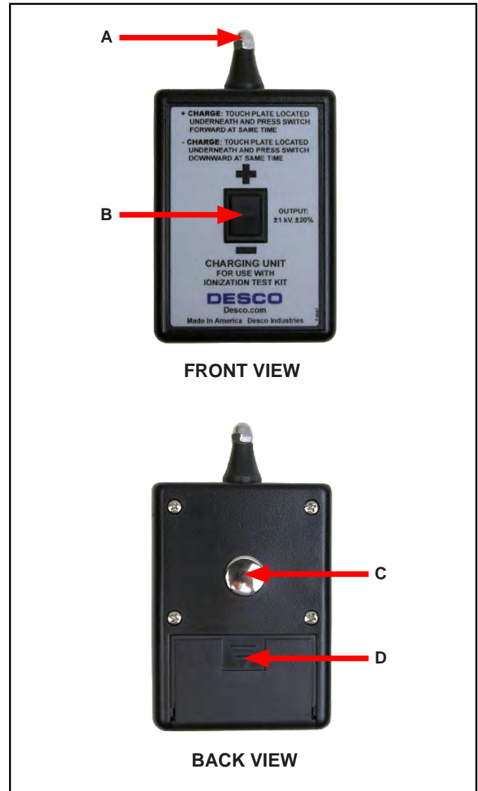
Figure 3. Charger features and components

A. Output Contact: The output contact is connected to an internal power source. When the touch plate located underneath the unit is connected to ground, the output contact will provide a charge of the indicated polarity. The charger is designed so that an operator can press the rocker switch and touch the plate simultaneously with the fingers of the same hand.