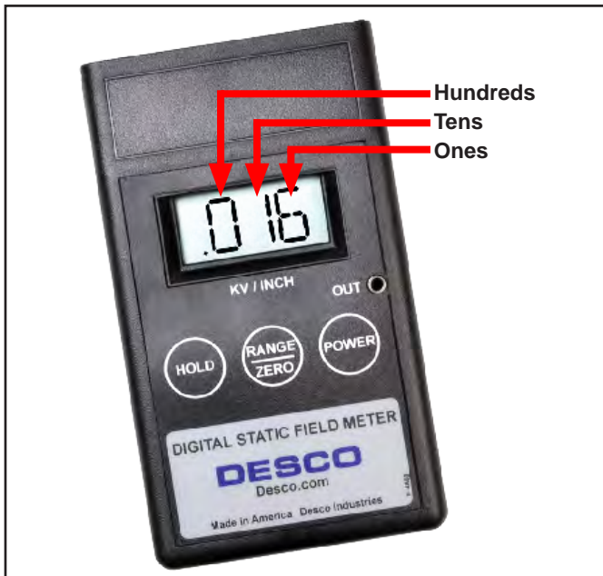
Figure 7. Reading the Digital Static Field Meter while in the \pm 2 kV range

Per ESD TR53-2006 Compliance Verification of ESD Protective Equipment and Materials Air Ionizer Test Procedure Initial Test Setup "Measurements should be