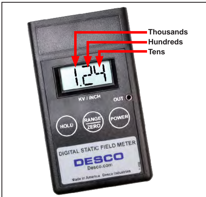
Figure 6. Reading the Digital Static Field Meter while in the \pm 20 kV range

Press the HOLD button to freeze the reading from the object on the display and the analog output signal. This feature allows the operator to move the Meter where it may be more easily read or saved for later reference.