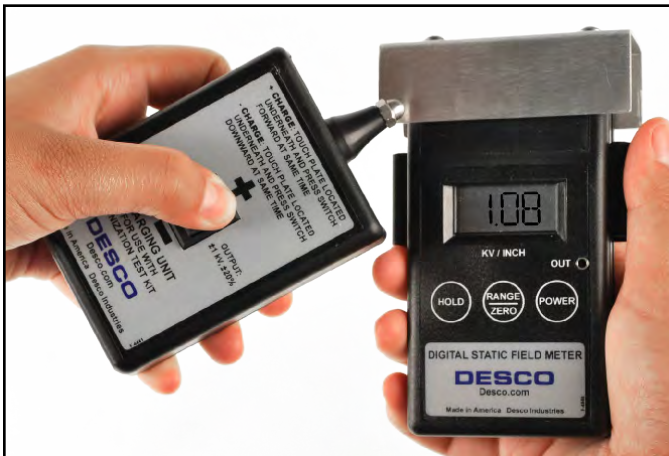
Figure 8. Taking decay measurements

IMPORTANT: A ground path must be provided between the touch plate of the Charger and the ground reference of the Field Meter. This is normally provided by holding the Charger in one hand and the Field Meter with Conductive Plate in the other.