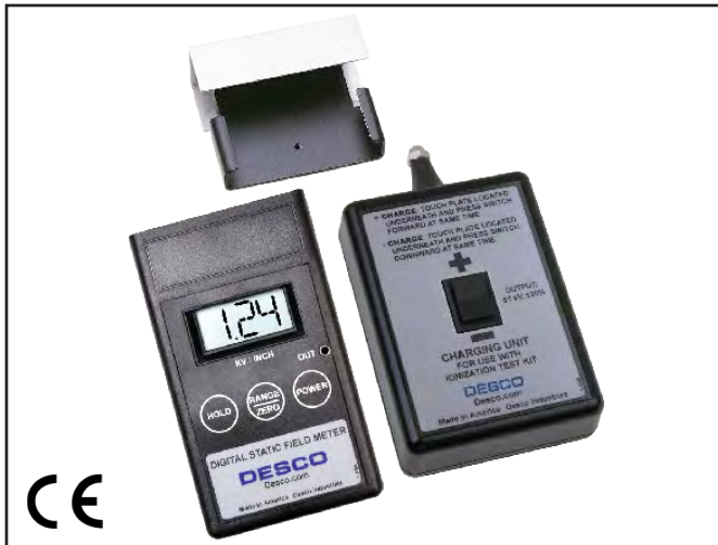
Figure 1. Desco 19493 Ionization Test Kit