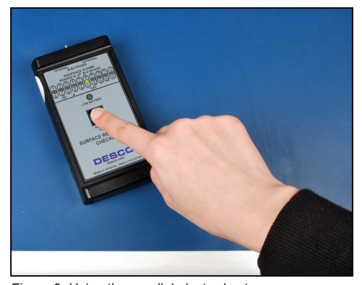
Figure 3. Using the parallel electrodes to measure surface resistance

If the measurement is outside acceptable limits, clean the surface with an ESD cleaner containing no insulative silicone such as Desco 10435 Reztore® Surface & Mat Cleaner, and re-test to determine if the cause of failure is an insulative dirt layer or the ESD worksurface material.