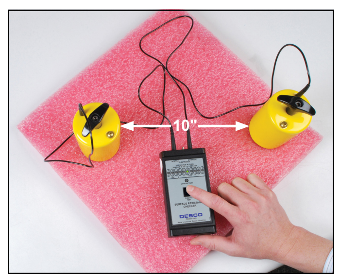
Figure 4. Using the 19641 test leads and 50003 fivepound electrodes to measure Rtt

Clean the material's surface for test lab measurements, but do not clean the surface for materials that are already installed. Only clean and re-test the installed material if failure occurs.