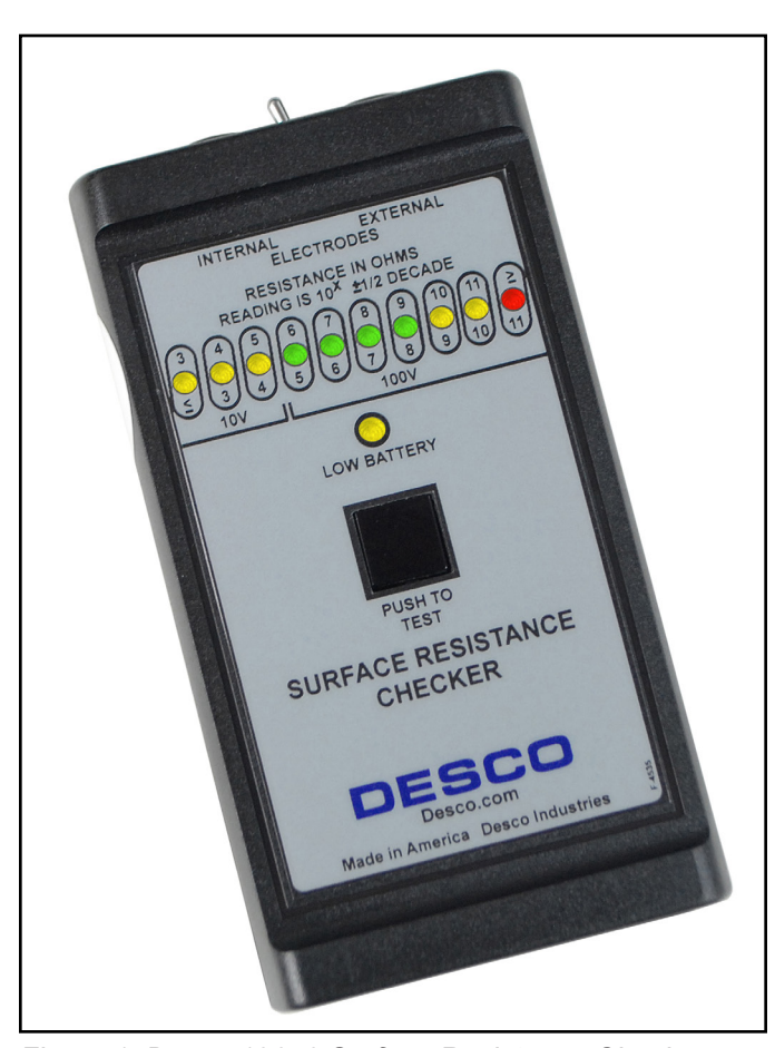
Figure 1. Desco 19640 Surface Resistance Checker