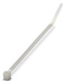
Cable tie, dimensions: L x W, 100 x 2.5 mm, color: transparent

Please be informed that the data shown in this PDF Document is generated from our Online Catalog. Please find the complete data in the user's documentation. Our General Terms of Use for Downloads are valid ( http://phoenixcontact.com/download )