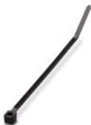
Cable tie, resistant to UV rays, dimensions: L x W, 140 x 3.6 mm, color: black

Please be informed that the data shown in this PDF Document is generated from our Online Catalog. Please find the complete data in the user's documentation. Our General Terms of Use for Downloads are valid ( http://phoenixcontact.com/download )