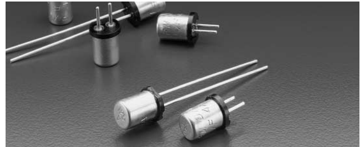
262 000 Series