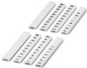
Zack marker strip flat, 10-section, vertically labeled with the consecutive numbers: 41 ... 50, white

Please be informed that the data shown in this PDF Document is generated from our Online Catalog. Please find the complete data in the user's documentation. Our General Terms of Use for Downloads are valid ( http://phoenixcontact.com/download )