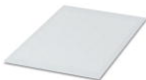
The figure shows a version of the article

Marker strip, can be ordered: Sheet, white, labeled according to customer specifications, Mounting type: Adhesive, Lettering field: 186 x 3.8 mm