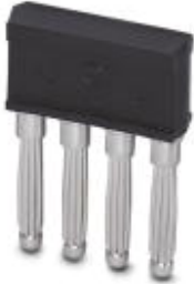
Short-circuit connector, Pitch: 8 mm, Number of positions: 4, Color: black

Please be informed that the data shown in this PDF Document is generated from our Online Catalog. Please find the complete data in the user's documentation. Our General Terms of Use for Downloads are valid ( http://phoenixcontact.com/download )