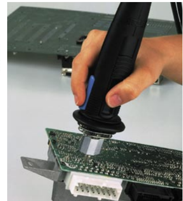
X-Tool - high-power through-hole desoldering for high-mass SMD soldering

with i-Tool soldering iron with patent pending heating technology and X-Tool, 102 soldering tip series see page 16, 722 desoldering tip series see page 18