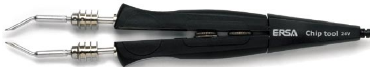
Chip tool SMT desoldering tweezers for low-temperature, safe SMD soldering