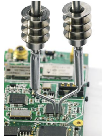
Chip tool application

with i-Tool soldering iron with patent pending heating technology and Chip tool, 102 soldering tip series see page 16, 422 desoldering tip series see page 19