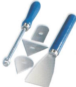
Paint scraper kit