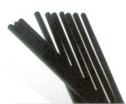
Plastic welding rod