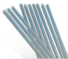
Plastic welding rod