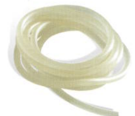
Plastic welding rod

for suspending from spring balancers in production lines