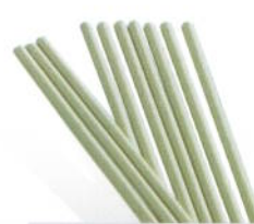
Plastic welding rod