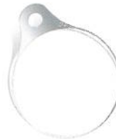
HL hanging loop (HG 2310 LCD)

holds the tool in position for a variety of work processes