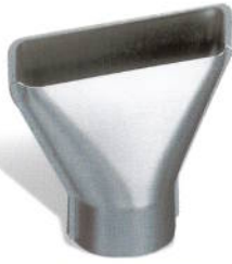
Window nozzle 75 mm

For shaping and shrink-fitting large diameters