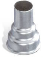
Reduction nozzle 20 mm

Pinpoint source of heat for de-soldering and for welding PVC