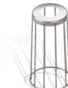
Guard cage (HG 2000 E)

For working with plastic welding rod up to 6 mm in dia. Pushes onto 9 mm reduction nozzle