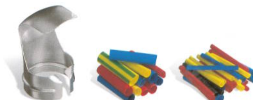
Shrink tubing kit