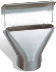
Large reflector nozzle