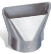
Window nozzle 50 mm

For soldering and shrink-fitting soldering sleeves and shrink-on tubing