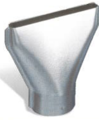
Surface nozzle 75 mm

Deflects to prevent panes of glass etc. from overheating