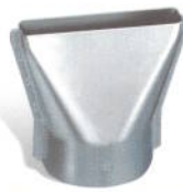
Surface nozzle 50 mm

Deflects to prevent overheating in narrow spots