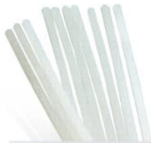
Plastic welding rod

for securely welding plasticised PVC plastics