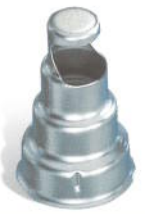
Soldering reflector nozzle

Pinpoint source of heat for de-soldering and for welding PVC