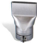
Flat nozzle 70 x 10 mm