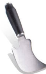
Quarter-moon crucible steel knife

Blade holder, nickel- plated, with replacement blades in wooden shank. Depth setting adjustable. For planing or lifting out the welding cord joint in vinyl and linoleum, PVC etc. Replacement blade ground on both sides