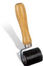
Unilaterally supported pressure roller, 50 mm