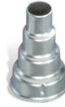
Reduction nozzle 14 mm

Spreads air over wider area for drying, paint stripping, etc.