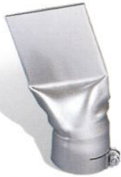
Flat angled nozzle 74 x 3 mm