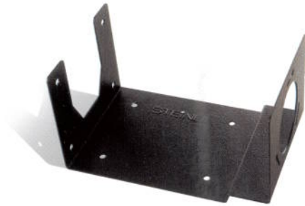
HL hot-air tool holder (HG 5000 E, HG 4000 E, HG 2300 EM and HG 2300 E)