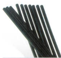
Plastic welding rod