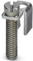
Chain bridge, pitch: 8 mm, number of positions: 1, color: silver

Please be informed that the data shown in this PDF Document is generated from our Online Catalog. Please find the complete data in the user's documentation. Our General Terms of Use for Downloads are valid ( http://phoenixcontact.com/download )