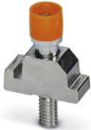
Slide, Color: silver

Please be informed that the data shown in this PDF Document is generated from our Online Catalog. Please find the complete data in the user's documentation. Our General Terms of Use for Downloads are valid ( http://phoenixcontact.com/download )