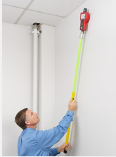
Trace wires in hard to reach places with the TIC 410A.