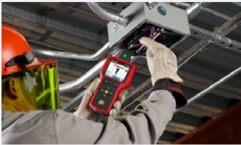
Trace energized or de-energized wires by removing the junction box cover.