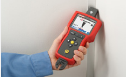
Use the Tip Sensor to trace wires in hard to reach areas.