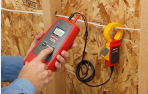
Induce signal with the signal clamp when there is no bare conductor