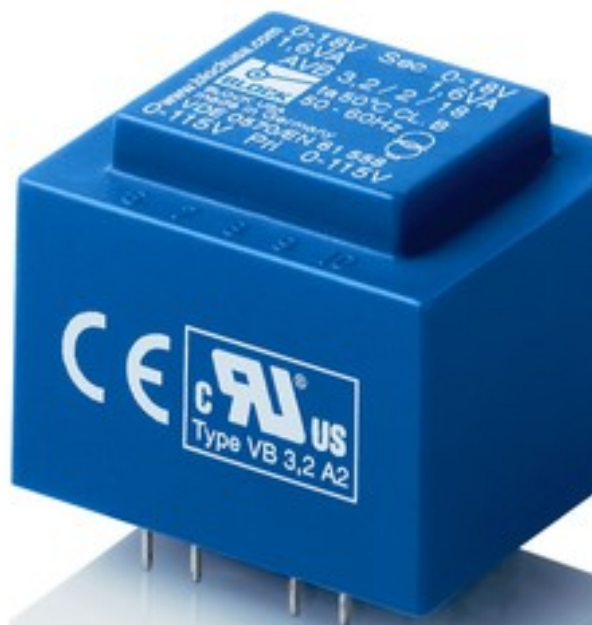
Picture shows AVB 3,2/2/18