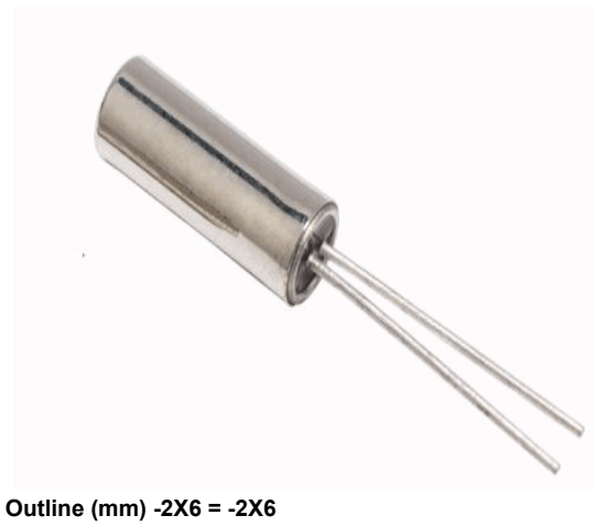
Outline (mm) -2X6 = -2X6